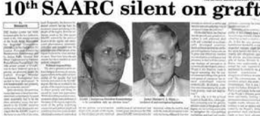
Portrait of a man