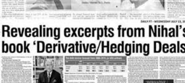
Portrait of a man