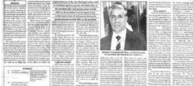
Portrait of a man