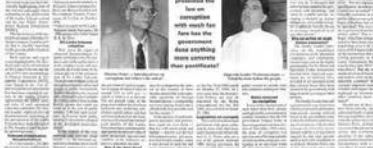
Portrait of a man