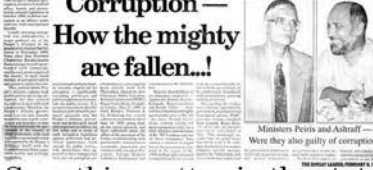
Portrait of a man