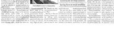
Portrait of a man