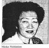
Portrait of a woman, likely a World Bank official.