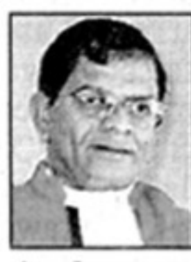
Asoka de Silva

Delivering the judgment of UN International Criminal Tribunal for Rwanda (ICTR), the tribunal presided over by Sri Lanka's former Chief Justice Asoka de Silva re-