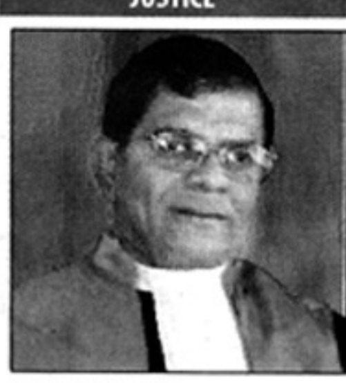
Asoka de Silva

The International Criminal Tribunal for Rwanda, presided over by Sri Lanka's Former Chief Justice, Asoka de Silva, convicted former military chaplain Emmanuel Rukundo and sentenced him to 25 years in jail.