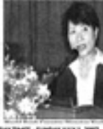
Man speaking at a press conference.

High growth of poverty, bureaucratic regulation, increased electricity costs, lack of infrastructure, lack of skilled HR - key impediments to growth. Country Director of the World Bank in Sri Lanka has expressed concern over the growth pattern in the island nation. He said that the high growth of poverty, bureaucratic regulation, increased electricity costs, lack of infrastructure, and lack of skilled HR are key impediments to growth.