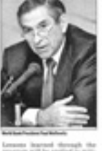
Man speaking at a press conference.

New anticorruption tool increases risk to firms engaging in fraud and corruption The World Bank has launched a voluntary disclosure program that will encourage firms to report any fraud or corruption in their operations. The program is designed to help firms identify and address any issues before they become a problem. The program is designed to help firms identify and address any issues before they become a problem. It is a voluntary disclosure program that will encourage firms to report any fraud or corruption in their operations.