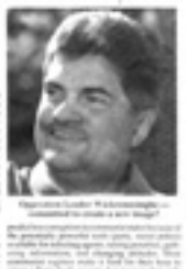
Portrait of a man

Corruption is a social, political and economic phenomenon that has become a global phenomenon. It is a multi-faceted problem that has become a global phenomenon. It is a multi-faceted problem that has become a global phenomenon.