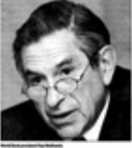
Man speaking at a press conference.

According to a report, the World Bank's top official is under scrutiny for alleged involvement in a corruption case. The report is part of a broader investigation into the bank's operations in Sri Lanka. According to a report, the World Bank's top official is under scrutiny for alleged involvement in a corruption case. The report is part of a broader investigation into the bank's operations in Sri Lanka.