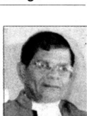
Asoka de Silva

The recent appointment of former Chief Justice Asoka de Silva as legal advisor to the President has raised eyebrows amongst the legal fraternity.