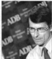
Man speaking at a press conference.

International co-operation essential to extradite suspects in economic crimes More than 67,500 officials have been punished for corruption in the past five years, a senior official of the Supreme People's Procuratorate said. More than 67,500 officials have been punished for corruption in the past five years, a senior official of the Supreme People's Procuratorate said.