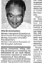
Man speaking at a press conference.

The UN Convention against Corruption (UNCAC) is a landmark international instrument that aims to prevent and combat corruption. Sri Lanka has implemented several measures to align with the convention, but there is still a long way to go. The UN Convention against Corruption (UNCAC) is a landmark international instrument that aims to prevent and combat corruption. Sri Lanka has implemented several measures to align with the convention, but there is still a long way to go.