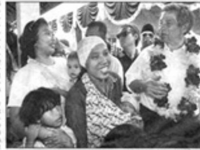
World Bank President Paul Wolfowitz (right) with Indonesian Ambassador during his visit to Jakarta, Indonesia.