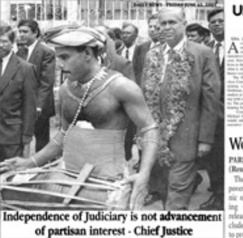
Independence of Judiciary is not advancement of partisan interest - Chief Justice