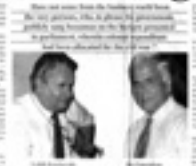
Two men in suits, likely industry leaders, in a meeting.