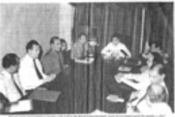
A group of people sitting around a table in a meeting.